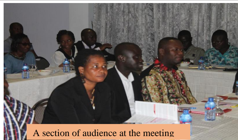
A section of audience at the meeting

There was also a call for comprehensive national SRHR curriculum to be developed and implemented universally for children in and out of school across the country; the redrafting of the current law on abortion to reflect growing international practices, and also ensure the strict implementation of Child Marriage Policies were also part of the advocacy.