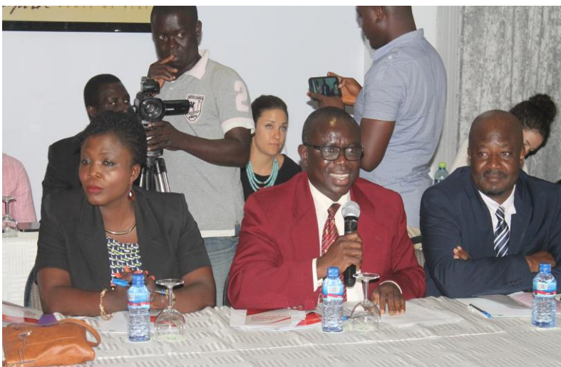
Vice chair of the parliamentary committee on health making statement during the meeting