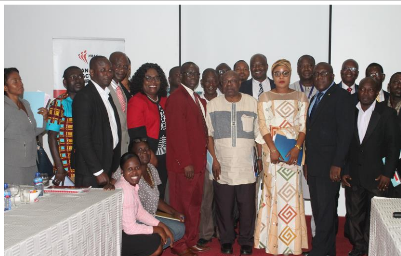
GCNH and HRAC in picture with Parliamentary committee on health

He said the project was very important, as it provided an overview of the country's SRHR presented several recommendations on how government might address the current gaps, and gave the assurance that Parliament would consider SRHR as a critical base for good health and national development and support its improvement. The GCNH presented a position paper on immunization and family planning to the parliamentary select committee.